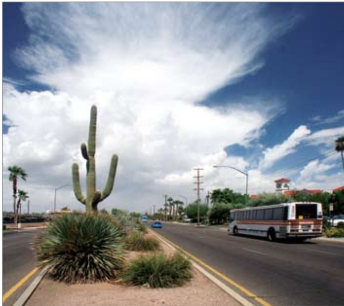
Figure 3. Tucson metropolitan area arterial.

During the development of the regional signal program section of the RCTO, PAG and the RCTO stakeholders helped to secure funding for the program from local taxes through the Regional Transportation Authority funding program for the first 5 years; the RCTO group plans to apply for TIP funding following that time.